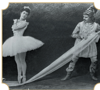
1892 ballet “The Nutcracker”